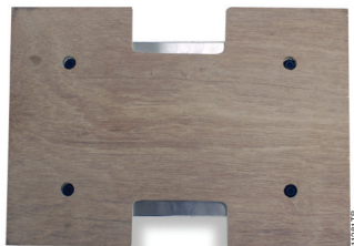
Figure 1. Place the instrument upside down on a stable surface. Remove the 4 screws holding the HSM 3.0 Instrument to the plywood.